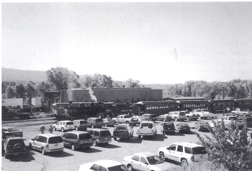
Volunteers placed salvaged bridge timbers and ties in the Chama depot parking lot creating diagonal parking and one-way traffic through the lot, May 2004.