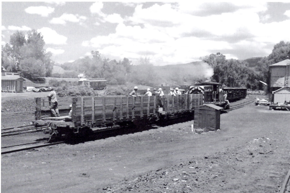
Leaving Chama to pick up brush along the right-of-way, June 2004.