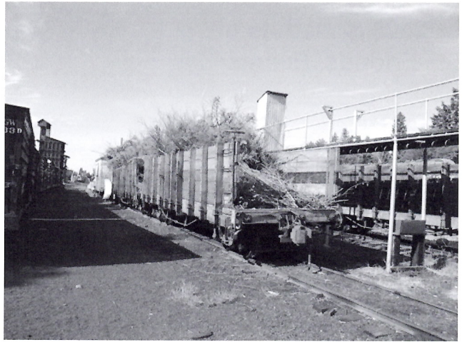
Two gondolas in the Chama yard with full loads of brush, June 2004.