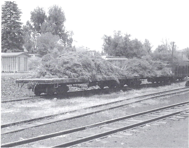
Two flat cars loaded with brush in the Chama yard, June 2004.